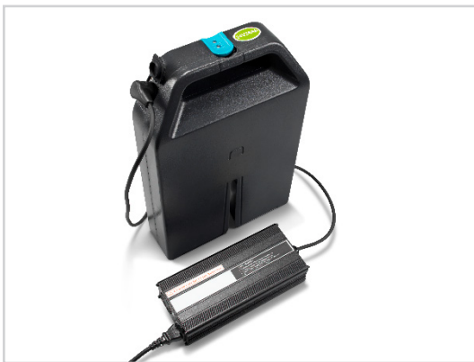
Li-ion 24V-36Ah battery Fast charging in ~ 2.5 hours