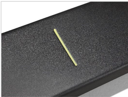
Marks for easy pallet handling