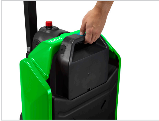
Ultra-simple battery changing